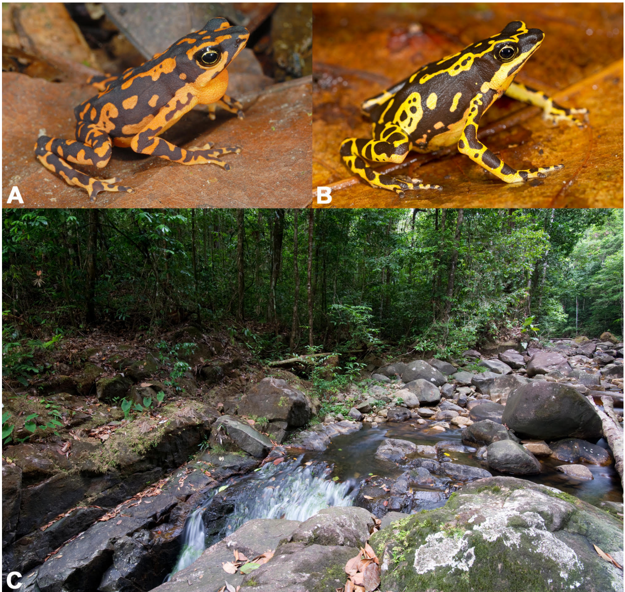
Fig. 1. (A) Orange and (B) Yellow color morphs of Atelopus hoogmoedi , both encountered at the studied locality in the Iwokrama Mountains, Guyana. (C) Typical breeding habitat of A. hoogmoedi in the Iwokrama Mountains.

in the north of the reserve and 1,400 mm in the south of the reserve (MPFITRF 2009). Wet season usually extends from May to August and again from November to February (MPFITRF 2009), although this has seemed more irregular in recent years, especially during El Niño events (reported as particularly strong in 2015, and the months of November and December 2015 were very dry in Iwokrama).